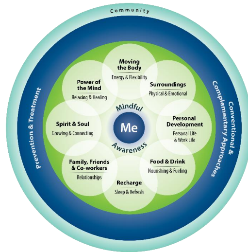
Figure 1. The Circle of Health.